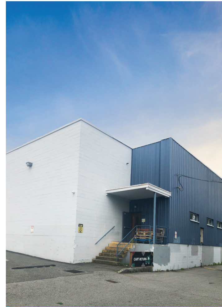
SUNGIVEN FOODS LOADING

The properties are located on the Southeast corner of Hastings and Gilmore with a high level of connectivity with links to Tri-Cities, Burnaby, Vancouver/Downtown and the North Shore. The properties are a few minutes walk to major tenants along Hastings such as Chad Thai, Fortuna Bakery, Dollar Tree, Angry Otter Liquor Store, Starbucks, UPS, G&H Market Place, G&F Financial Group, HellCrust Pizza, Dairyqueen and so much more. This location offers excellent exposure within a high traffic area suitable for all types of retail/commercial businesses making it an excellent long term investment.