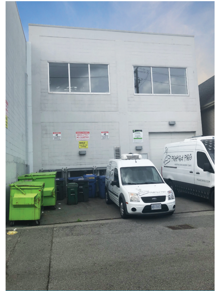
PEAK PIES LOADING